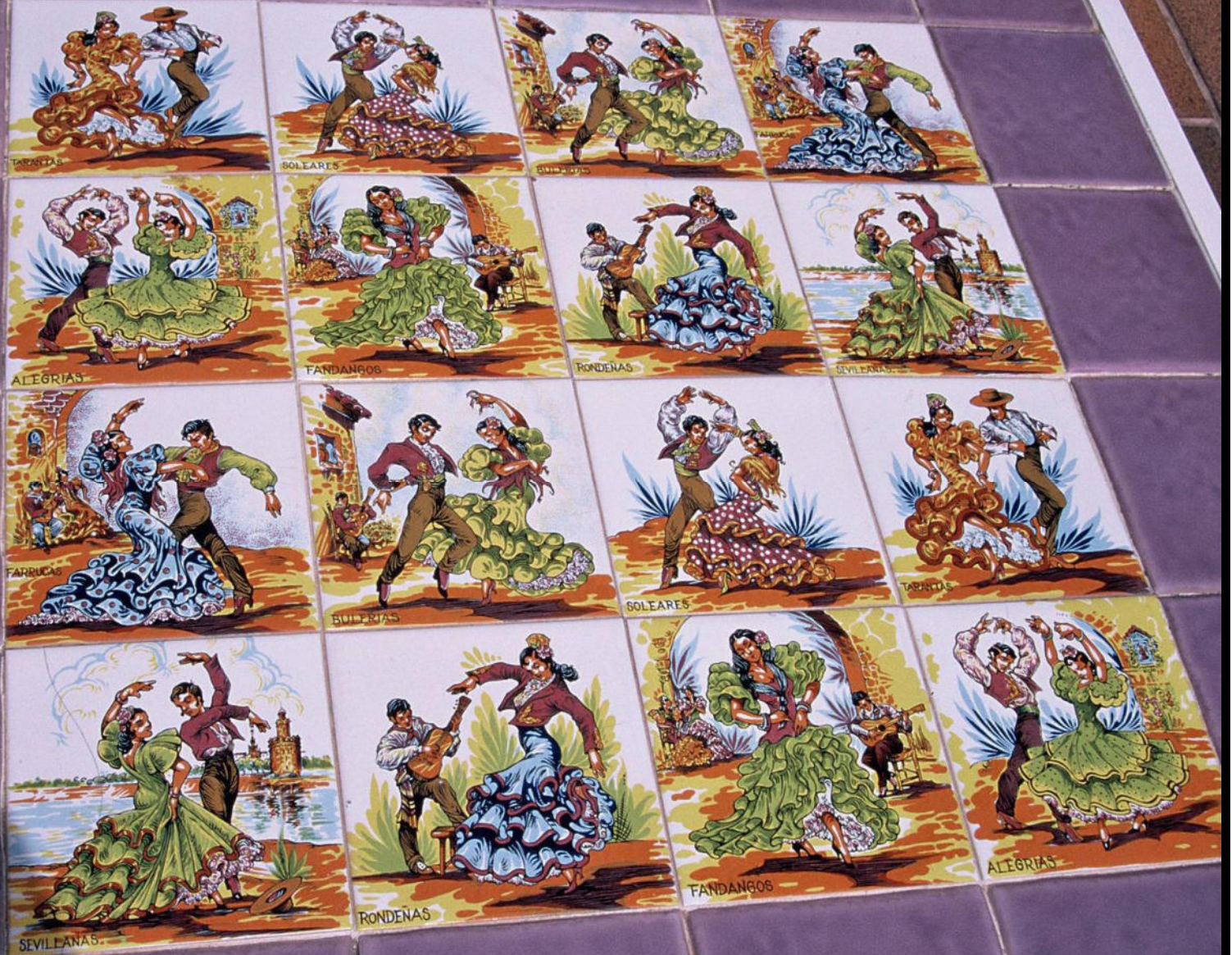
☺ Explore your need for closeness and distance with a playful and dancing easiness. ☺ Colorful tiles on the tables of a first class restaurant in the heart of the white village Arcos de la Frontera – September 2010