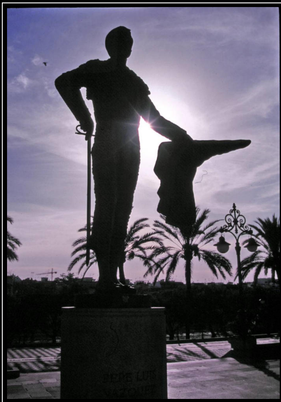
☺ Reflect consciously, what price you are willing to pay for status, fame and honor. ☺ One of the many statues of famous toreros (Pepe Luis Vasquez) in front of the bullfight arena of Sevilla – September 2010